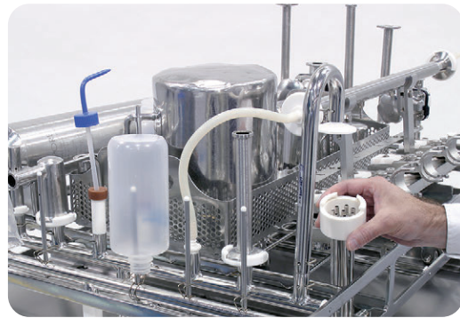
Part Washing Accessory