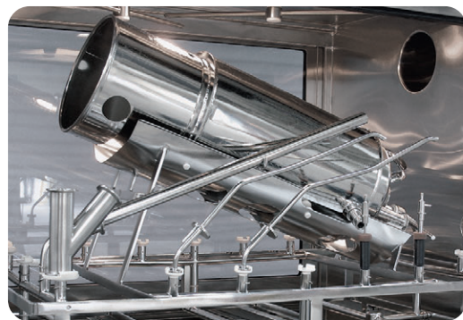
Accessory for Filter Housing