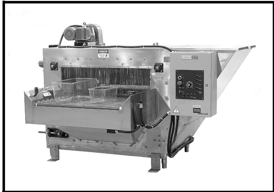
(Typical only - some details may vary.)

The Basil 3600 Bedding Dispenser is compatible with the following brands of bedding: