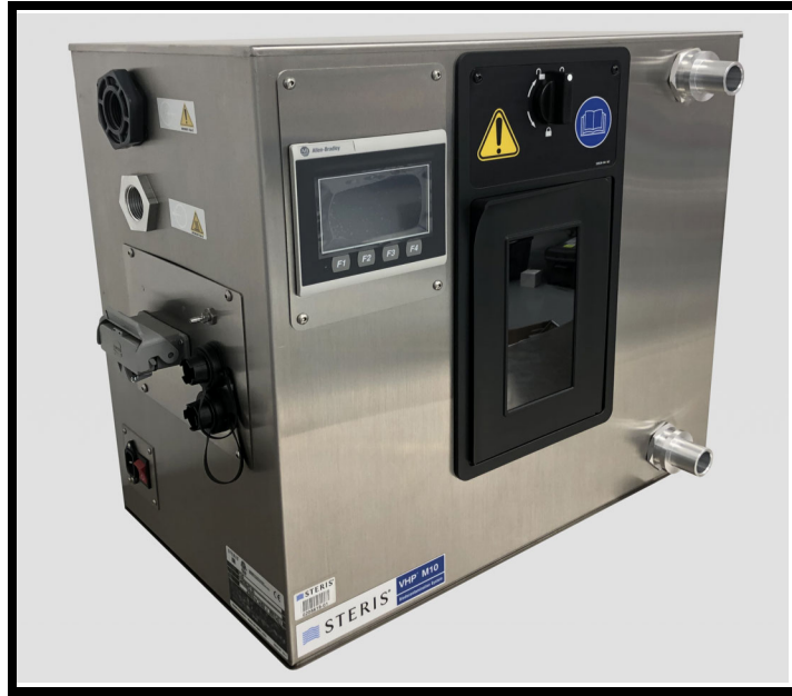
(Typical only - some details may vary)

Operator Language. VHP® M10 Biodecontamination Unit comes with English, French, Italian, German, Spanish, Dutch, and