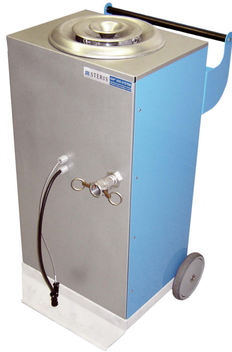
Room Circulation Unit