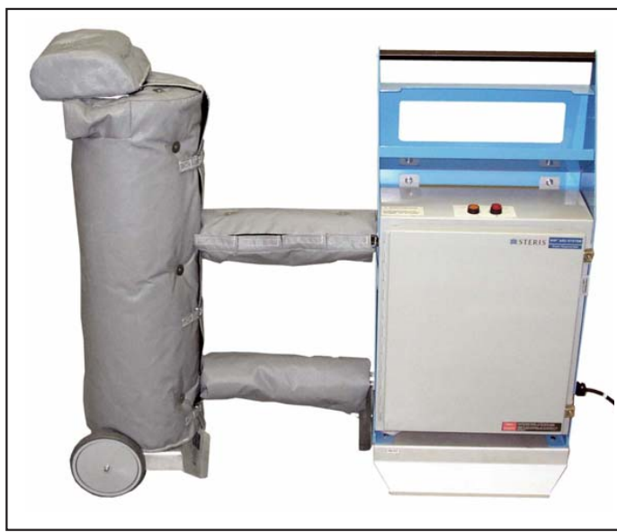
With High Capacity Dryer Tank