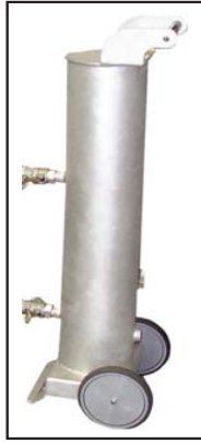
High Capacity Dryer