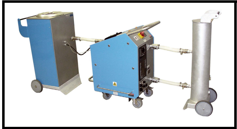
(Typical only - some details may vary.)

Use only Vaprox Hydrogen Peroxide Sterilant cartridges, containing STERIS-registered hydrogen peroxide which has been specially formulated, tested