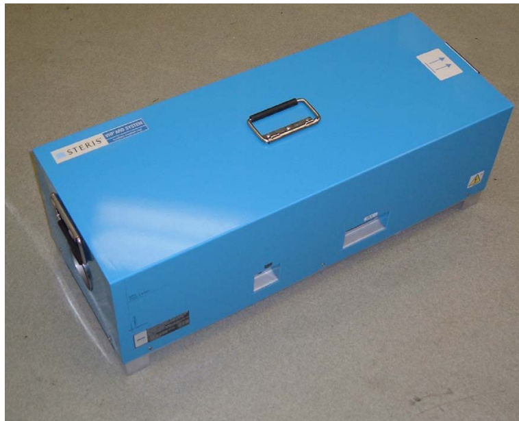
Auxiliary Aeration Unit