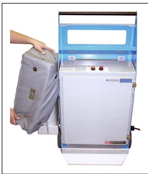
With Dryer Cartridge