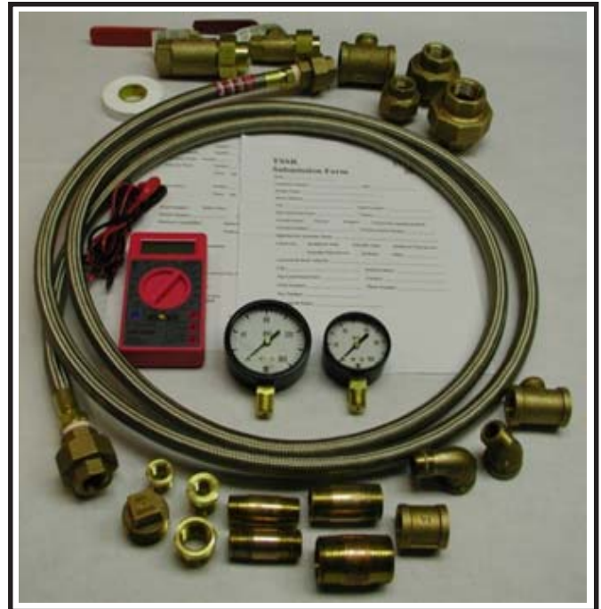
Utility Piping Verification Kit (Typical only - some details may vary.)

STERIS ® STERIS Corporation 2424 West 23rd Street Erie, PA 16506 Phone: 800-333-8828 -OR- Visit us online at: www.STERIS.com