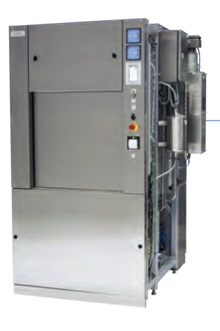
FINN-AQUA GLP Research Steam Sterilizer with Decontamination Cycle and Unique Virasure™ Air Decontamination System

AMSCO 110-250LS Small Sterilizers with compact footprint and STERI-GREEN Water Conservation Technologies